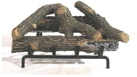
STEP FIVE: PLACE 12Y/VSA AS SHOWN