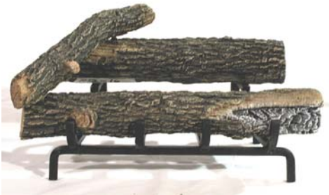
STEP THREE: PLACE 13Y/VSA AS SHOWN