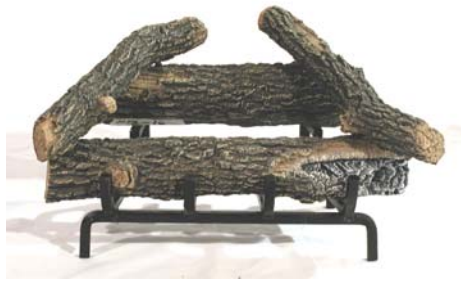
STEP FOUR: PLACE 15/VSA AS SHOWN