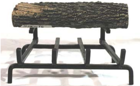
STEP ONE: PLACE 16/VSA AS SHOWN