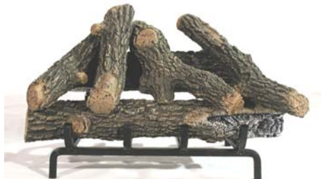
STEP SIX: PLACE 11/VSA AS SHOWN