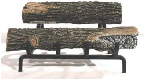
STEP TWO: PLACE 21/VSA AS SHOWN