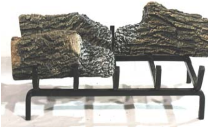
STEP THREE: PLACE 9L/VSA AS SHOWN