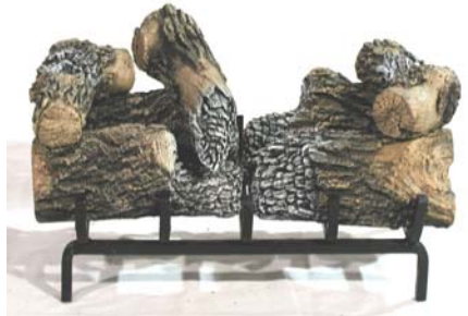
STEP SEVEN: PLACE 12K/VSA AS SHOWN