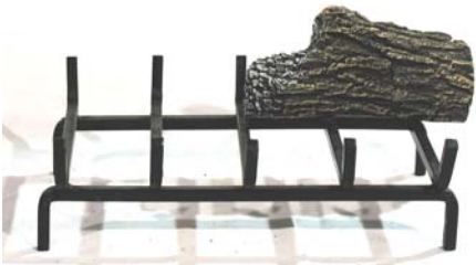
STEP ONE: PLACE 9L/VSA AS SHOWN