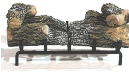
STEP SIX: PLACE 11C/VSA AS SHOWN