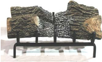
STEP FOUR: PLACE 9R/VSA AS SHOWN