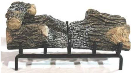
STEP FIVE: PLACE 11C/VSA AS SHOWN