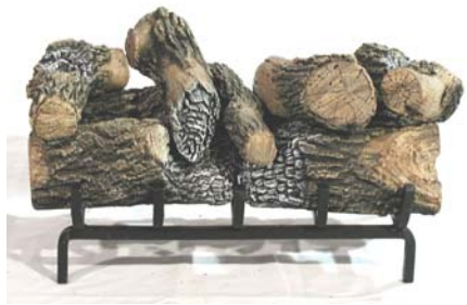
STEP SIX: PLACE 12/VSA AS SHOWN