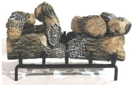
STEP FIVE: PLACE 12K/VSA AS SHOWN