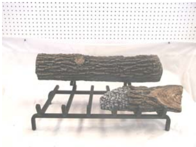
STEP TWO: PLACE 15L/VSA AS SHOWN