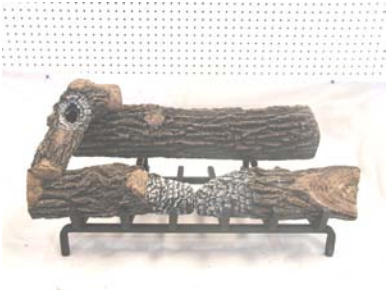
STEP FOUR: PLACE 11C/VSA AS SHOWN