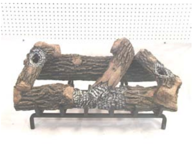
STEP SIX: PLACE 12K/VSA AS SHOWN