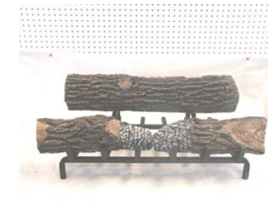
STEP THREE: PLACE 15R/VSA AS SHOWN