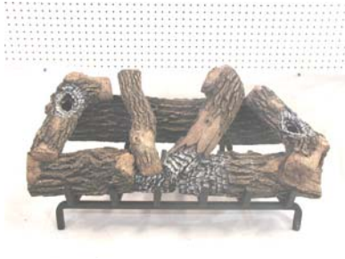
STEP SEVEN: PLACE 12/VSA AS SHOWN