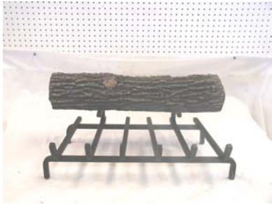
STEP ONE: PLACE 24/VSA AS SHOWN