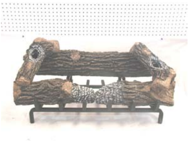
STEP FIVE: PLACE 11C/VSA AS SHOWN