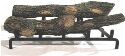
STEP TWO: PLACE 24C/VSA AS SHOWN