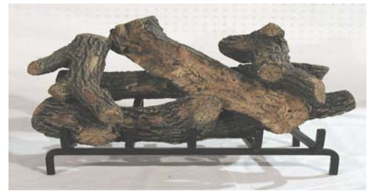
STEP FIVE: PLACE 14Y/VSA AS SHOWN