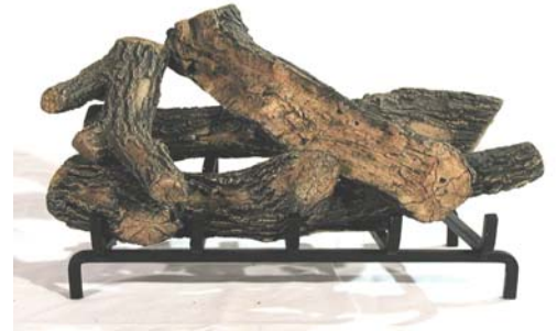
STEP FOUR: PLACE 14C/VSA AS SHOWN