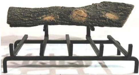
STEP ONE: PLACE 21P/VSA AS SHOWN