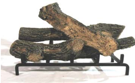
STEP THREE: PLACE 19C/VSA AS SHOWN