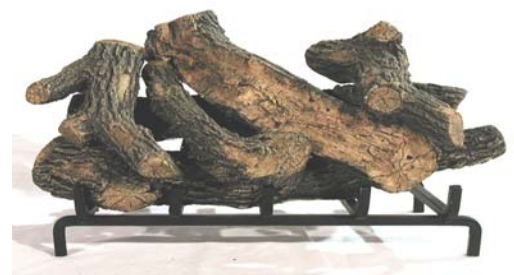
STEP SIX: PLACE 13C/VSA AS SHOWN