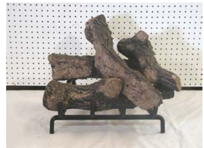
STEP FOUR: PLACE 14C/VSA AS SHOWN