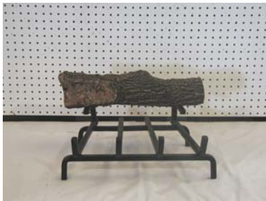
STEP ONE: PLACE 17P/VSA AS SHOWN