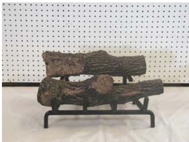
STEP TWO: PLACE 18C/VSA AS SHOWN