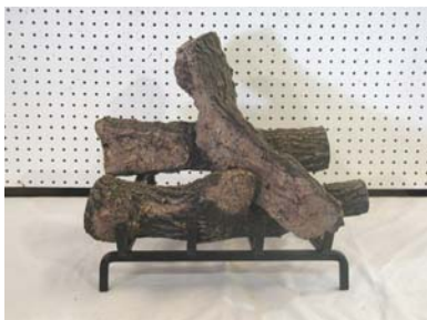
STEP THREE: PLACE 19C/VSA AS SHOWN