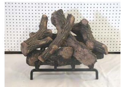
STEP SIX: PLACE 13C/VSA AS SHOWN