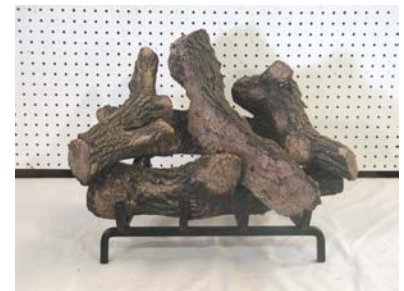
STEP FIVE: PLACE 14Y/VSA AS SHOWN