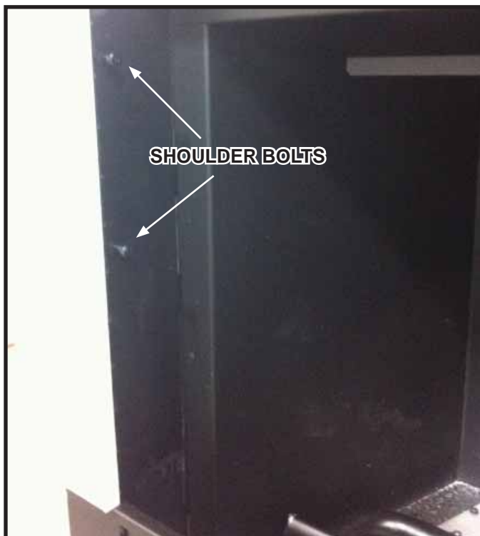
Figure 3. Location of Shoulder Bolts