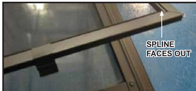
Figure 1. Location of Mesh Clips.