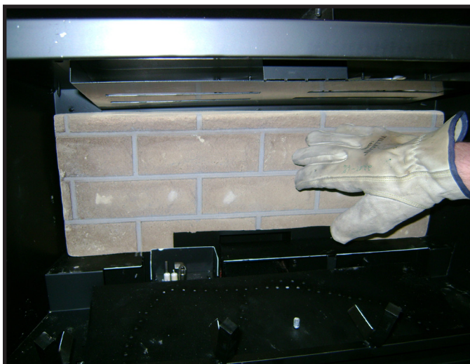
Figure 2. Install Back Refractory Panel