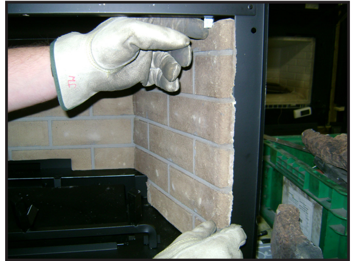
Figure 3. Install Side Refractory Panel