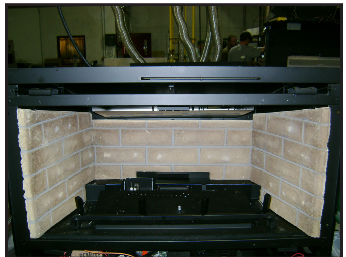
Figure 4. Refractory Panels Installed

Please contact your Heat & Glo dealer with any questions or concerns. For the location of your nearest Heat & Glo dealer, please visit www.heatnglo.com .