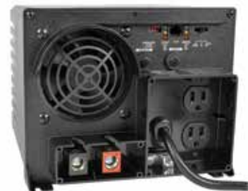
Tripp Lite APS750

750W PowerVerter APS 12VDC 120V Inverter/Charger with Auto-Transfer Switching