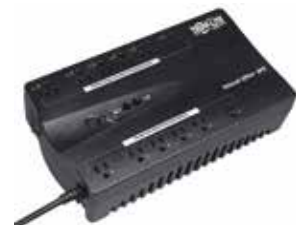
Tripp Lite INTERNET750U