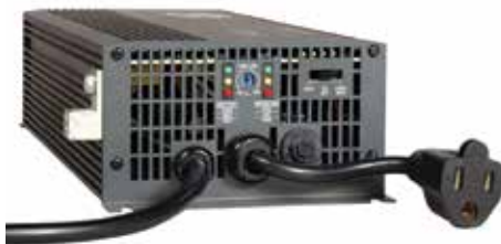
Tripp Lite APS700HF

700W PowerVerter APS 12VDC 120V Inverter/Charger with Auto-Transfer Switching