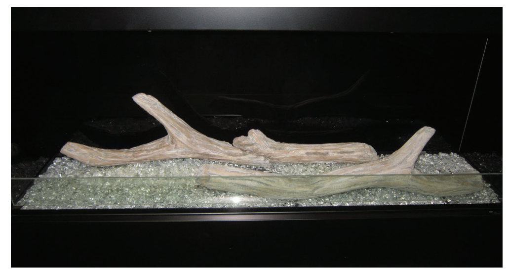
Figure 2 – Log Placement for AVFL42N(P)IP-BU, AVFL42N(P)IP-RB, AVFL48N(P)IP, AVFLST48N(P)IP, ODLANAIG-48 AND ODLANAIGST-48

WARNING: Log #3 does not get used with the AVFL42N(P)IP-BU, AVFL42N(P)IP-RB, AVFL48N(P)IP, AVFLST48N(P)IP, ODLANAIG-48 AND ODLANAIGST-48. This log should be discarded when installing this kit with these appliances. Do not install any extra logs in these units.