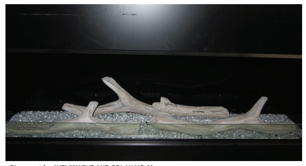
Figure 4 – Log Placement for AVFL60N(P)IP AND ODLANAIG-60

WARNING: Logs must be located in the correct position on the pins so they do not interfere with the burner surface.