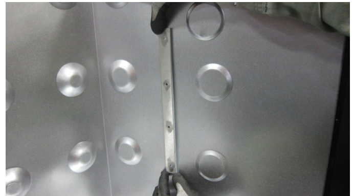
Figure 3 Installing Bracket on the Side