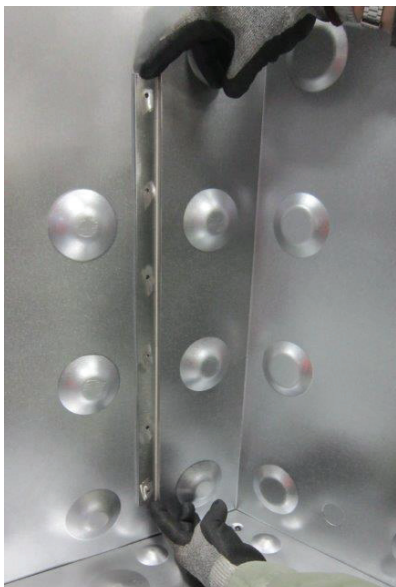
Figure 2 Installing Bracket on Back of a 36-Inch Unit One at Each End