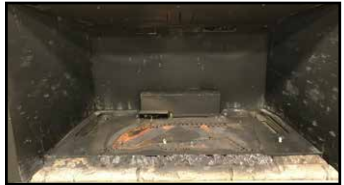
Figure 3. Base Refractory Installed