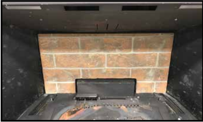
Figure 5 Back Refractory Installed

Be sure to hold back refractory in upright position until side panels get installed.