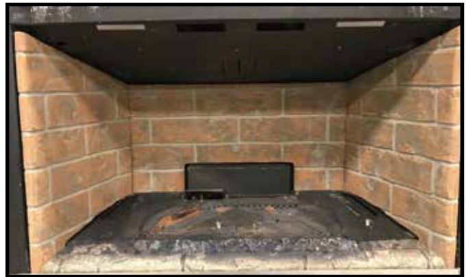
Figure 10 Refractory Kit Installed