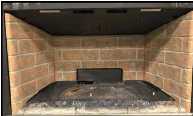
Figure 8. Refractory Kit Installed

Please contact your Hearth & Home Technologies dealer with any questions or concerns. For the location of your nearest Hearth & Home Technologies dealer, please visit www.hearthnhome.com .