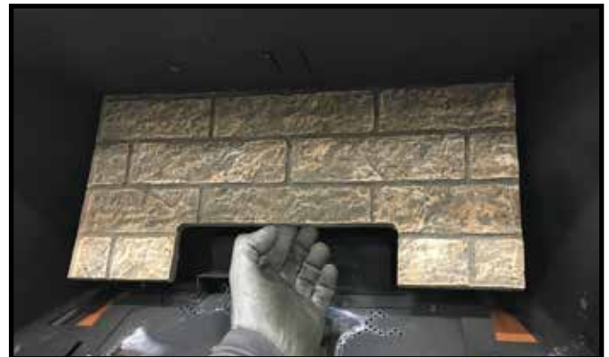
Figure 4. Back Refractory

Be sure to hold back refractory in upright position until side panels get installed.