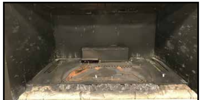
Figure 4 Base Refractory Installed