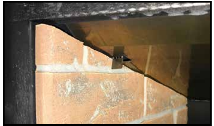
Figure 8 Left Refractory Handbend Tab