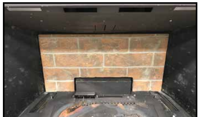
Figure 5. Back Refractory Installed