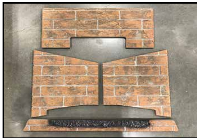
Figure 1. Refractory Kit Components

If replacement panels are needed, the entire kit must be ordered.