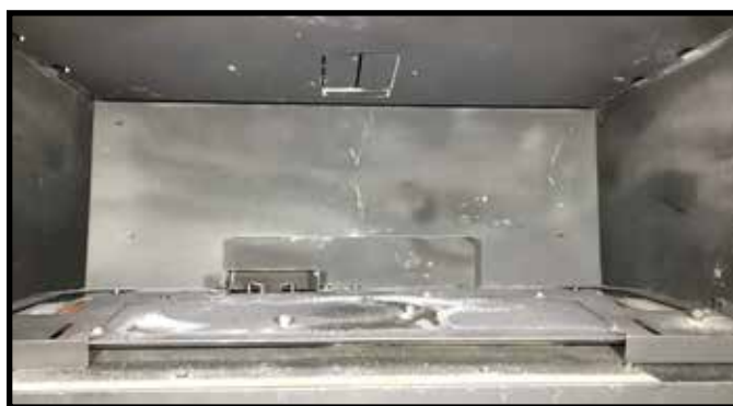
Figure 2. Empty Firebox