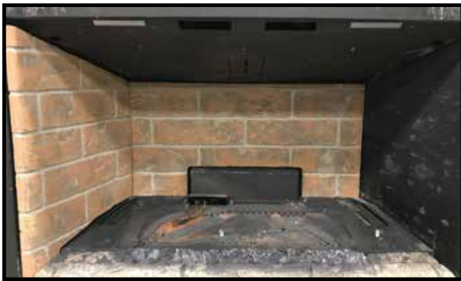
Figure 7. Left Refractory Installed