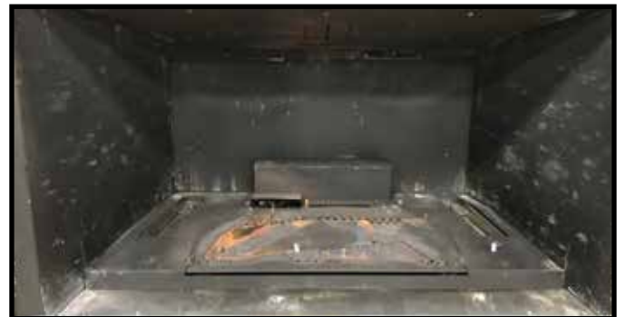
Figure 3 Empty Firebox