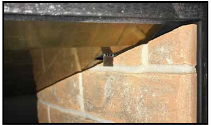
Figure 9 Right Refractory Handbend Tab