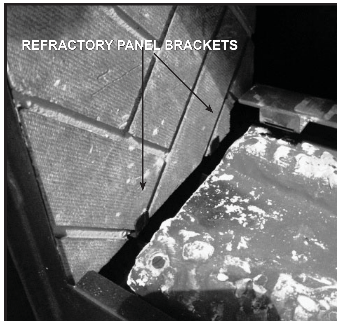
Figure 2. Bottom Refractory Panel Brackets