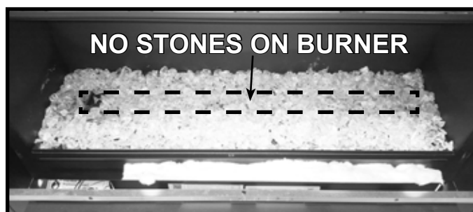
Figure 1. Stones Not Allowed on Burner

WARNING! Risk of Explosion! DO NOT place stones on burner! Delayed ignition could occur.