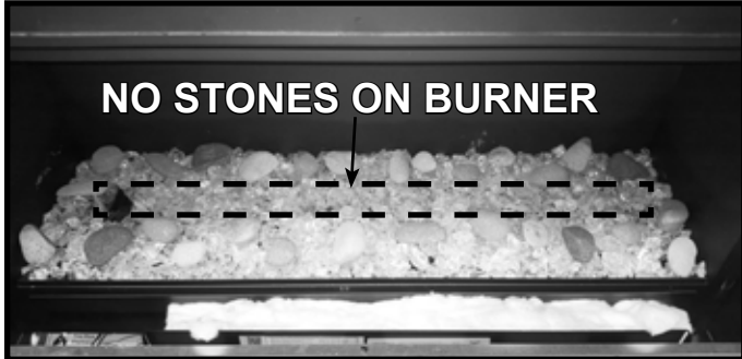
Figure 2. Stones installed (2 Kits)

NOTICE: DO NOT STACK STONES. Place stones in a single layer. Flame appearance could be impacted. Sooting could occur.