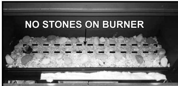
Figure 2. Stones installed (2 Kits)

NOTICE: DO NOT STACK STONES. Place stones in a single layer. Flame appearance could be impacted. Sooting could occur.