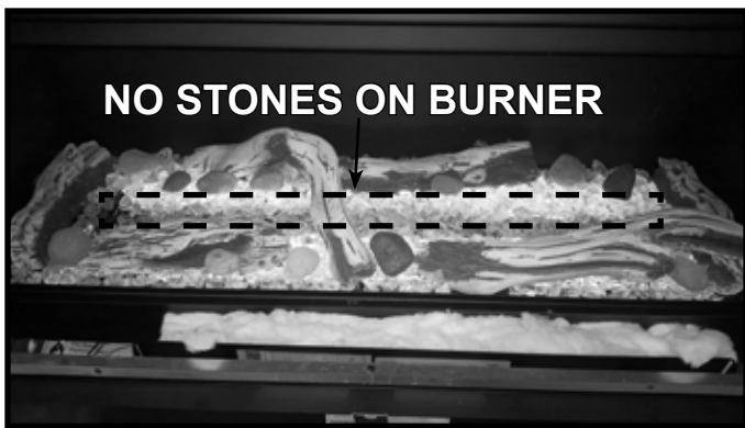
Figure 3. Stones (1 Kit) and Driftwood Logs Installed