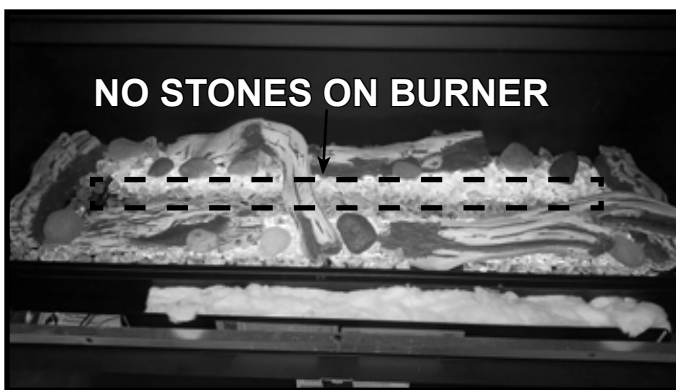
Figure 3. Stones (1 Kit) and Driftwood Logs Installed