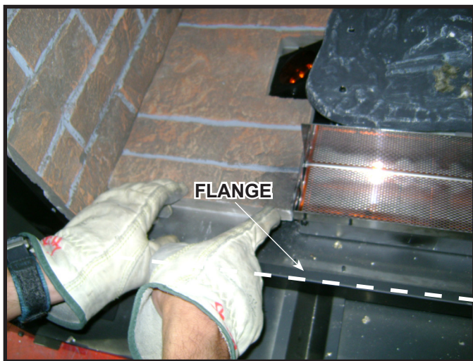
Figure 4. Positioning Left and Right Middle Base Refractory