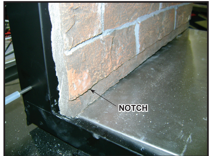
Figure 1. Notched End of Side Refractory