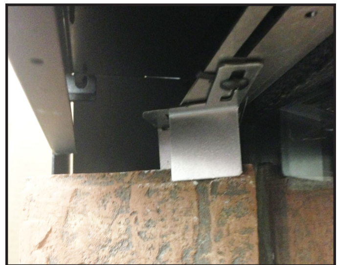
Figure 7. Side Refractory Brackets