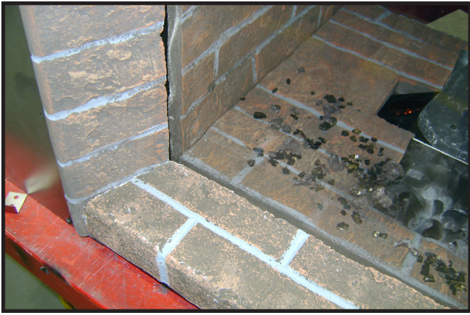
Figure 8. Outer Hearth Installation

Please contact your Majestic, Hearth & Home Technologies dealer with any questions or concerns. For the location of your nearest Majestic, Hearth & Home Technologies dealer, please visit www.majesticproducts.com .