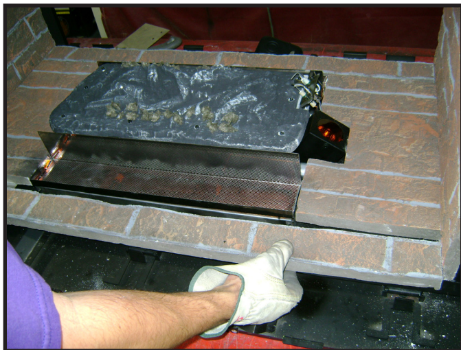
Figure 5. Positioning Outer Bottom Refractory.