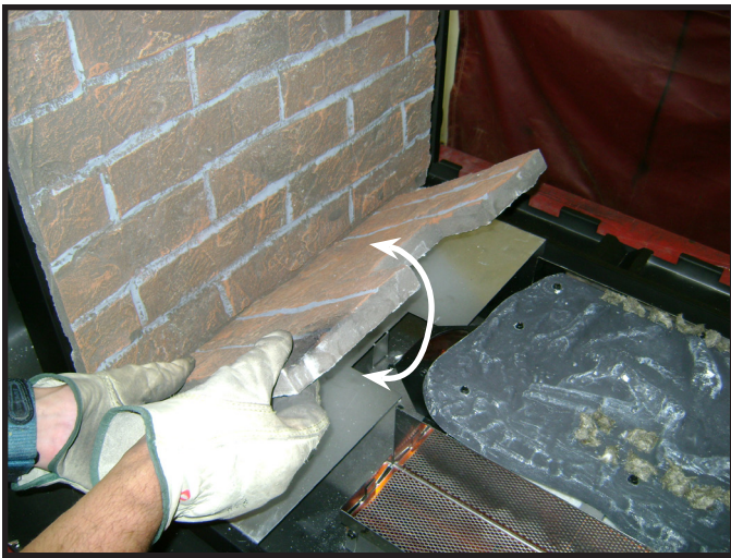
Figure 3. Positioning Inner Bottom Refractory