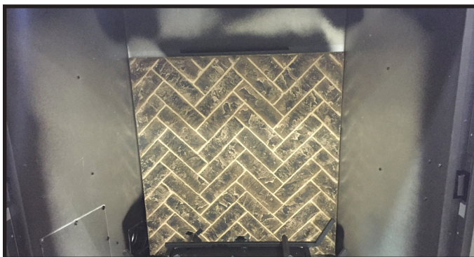
Figure 1. Install Back Panel