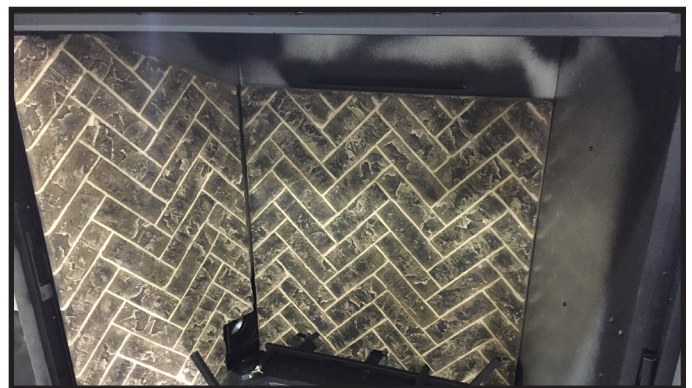
Figure 2. Install Left Side Panel