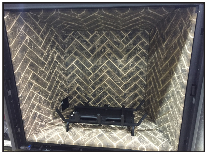
Figure 13. Right Base Refractory Piece Installed