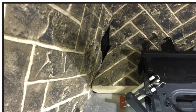
Figure 8. Back Left Base Panel In Position