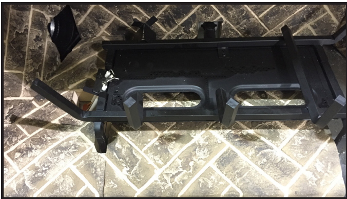
Figure 10. Middle Base Piece Installed

Note: The base pieces are designed to fit together tightly to minimize the visibility of the lines between them.