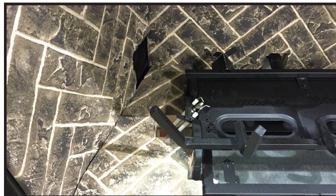
Figure 9. Front Left Base Piece Installed