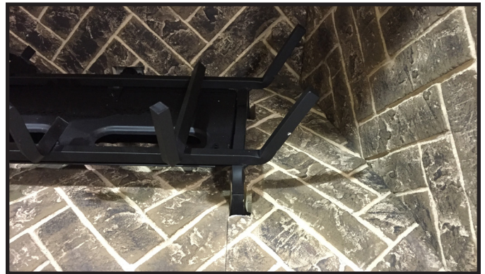
Figure 12. Right Base Refractory Piece Installed