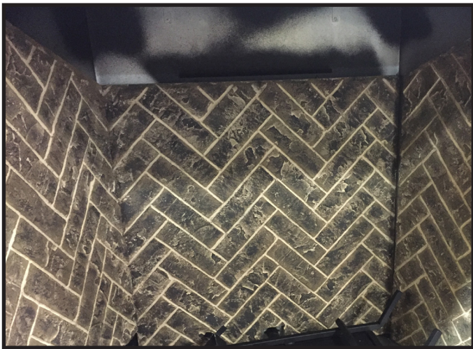
Figure 4. Install Right Side Panel