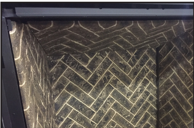
Figure 6. Fitted Top Panel