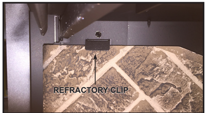
Figure 3. Side Panel Refractory Clip