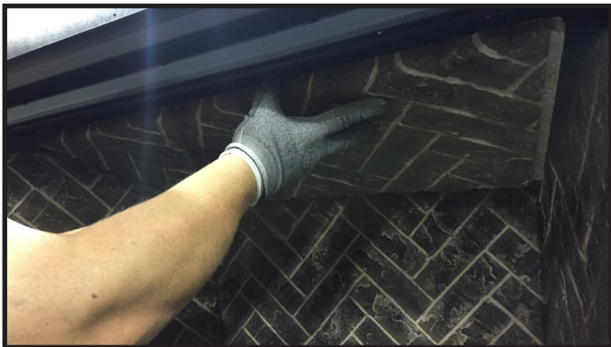
Figure 5. Install Top Panel