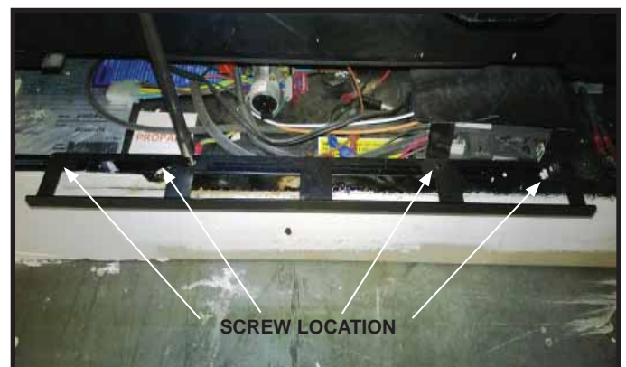
Figure 2. Replace Screws