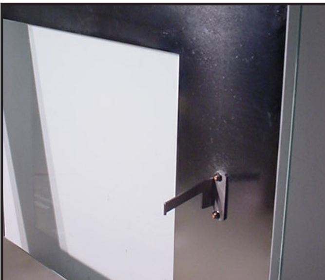
Figure 2 Hanging Bracket