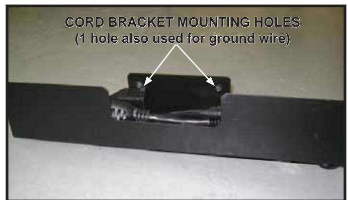
Figure 2. Install Cord Bracket Assembly