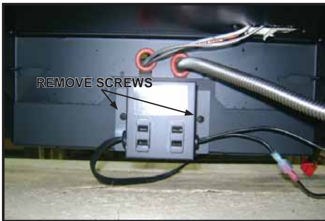
Figure 1. Remove Junction Box