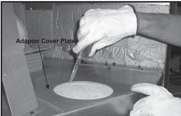
Figure 1. Cutting the Insulation