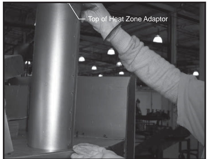
Figure 2. Installing the Heat Zone Adaptor

CAUTION! Risk of Cuts and Abrasions. Wear protective gloves and safety glasses during installation. Sheet metal edges are sharp.