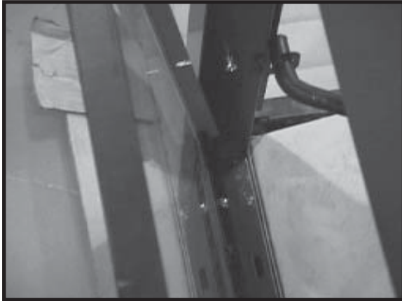
Figure 3 - Notches Sliding in to Engage Lugs