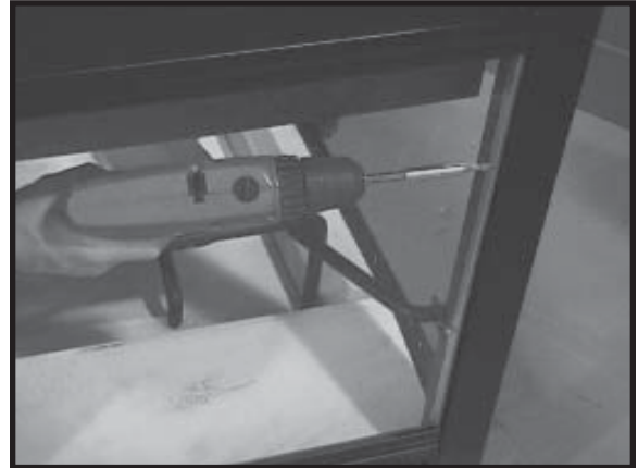
Figure 4 - Attaching Side Lip