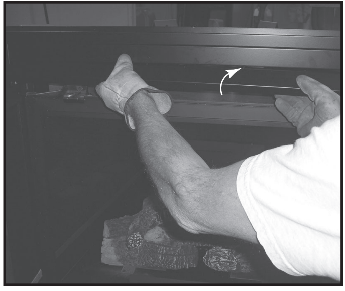
Figure 3. Install Hood