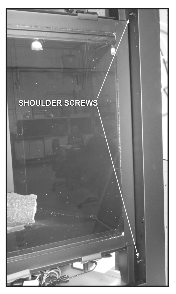
Figure 5. Hang Decorative Front on Shoulder Screws

Note: It may be necessary to adjust the hanging brackets slightly to make the decorative front hang squarely in the appliance opening.