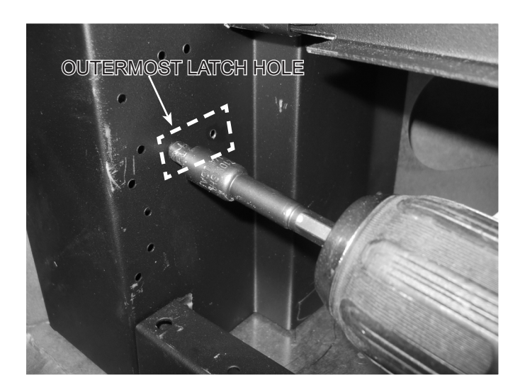
Figure 2. Install Shoulder Screw (1 Per Side)

2. Install a shoulder screw in the outermost hole from where the latches were removed. See Figure 2. Shoulder screws are located in the manual bag. Tighten shoulder screw until snug. Do not overtighten.