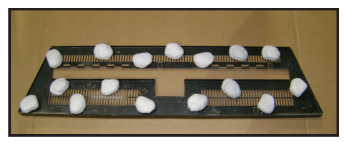
Figure 2. Place Large White Stones