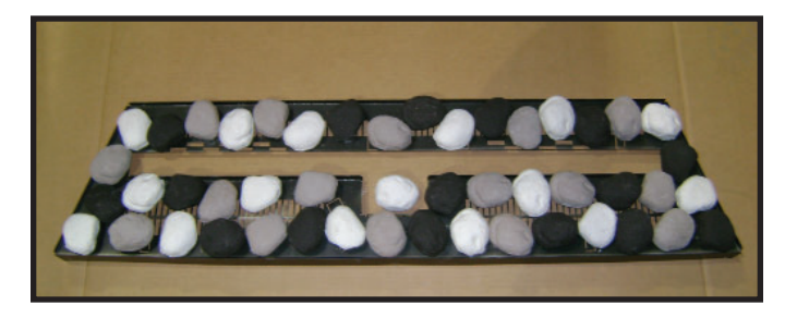
Figure 3. Place Large Gray and Black Stones

MEDIA-STONES-WH: Place large stones as shown in Figure 3.