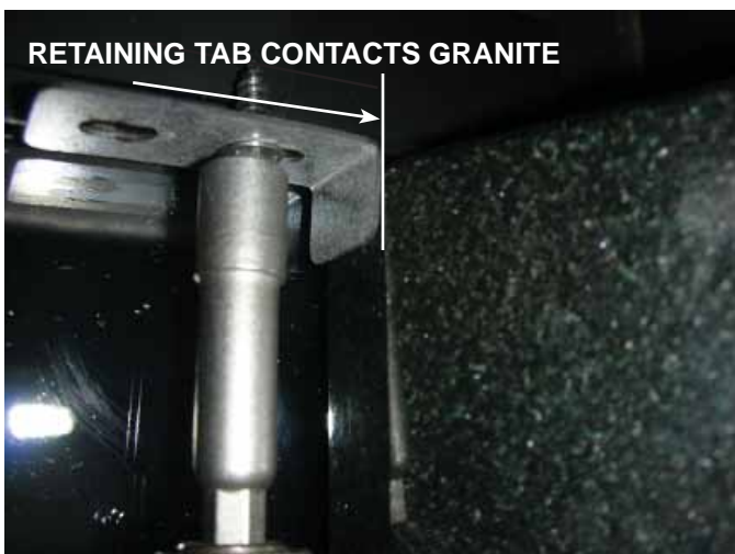
Figure 3. Placing Outer Corner Granite Trim Piece.