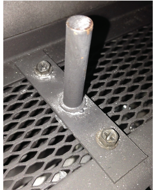
Figure 1 – Log Pin Assembly

NOTE: Prior to installing the log set, you must first install the pin brackets on the burner. The air deflection glass and fireglass should only be installed after the pin brackets are in place. The air deflection glass should be installed prior to placing and fireglass on the burner. The logs must then be placed in the unit after the fireglass and air deflection glass. If the optional logs are added after the air deflection glass and fireglass are in use, move the fireglass away from the areas in Figure 1 and install the support brackets, then arrange fireglass evenly across burner again.