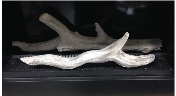
Figure 3– Front Log Placement