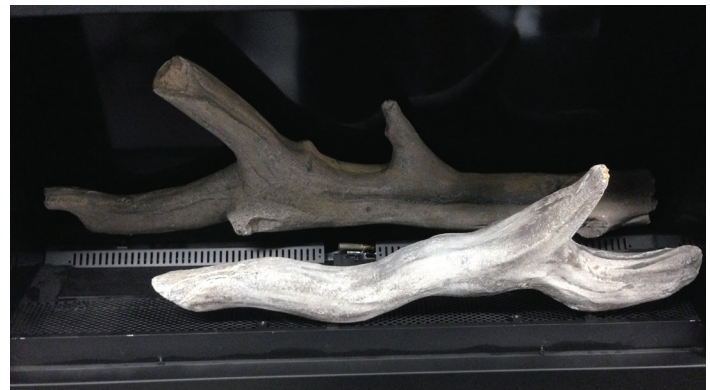
Figure 4 – Alternative Front Log Placement

Hearth & Home Technologies 7571 215th Street West, Lakeville, MN 55044 www.hearthnhome.com