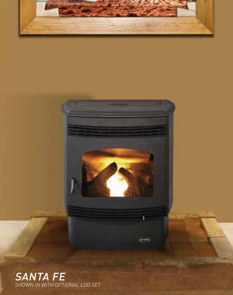
SANTA FE SHOWN IN WITH OPTIONAL LOG SET