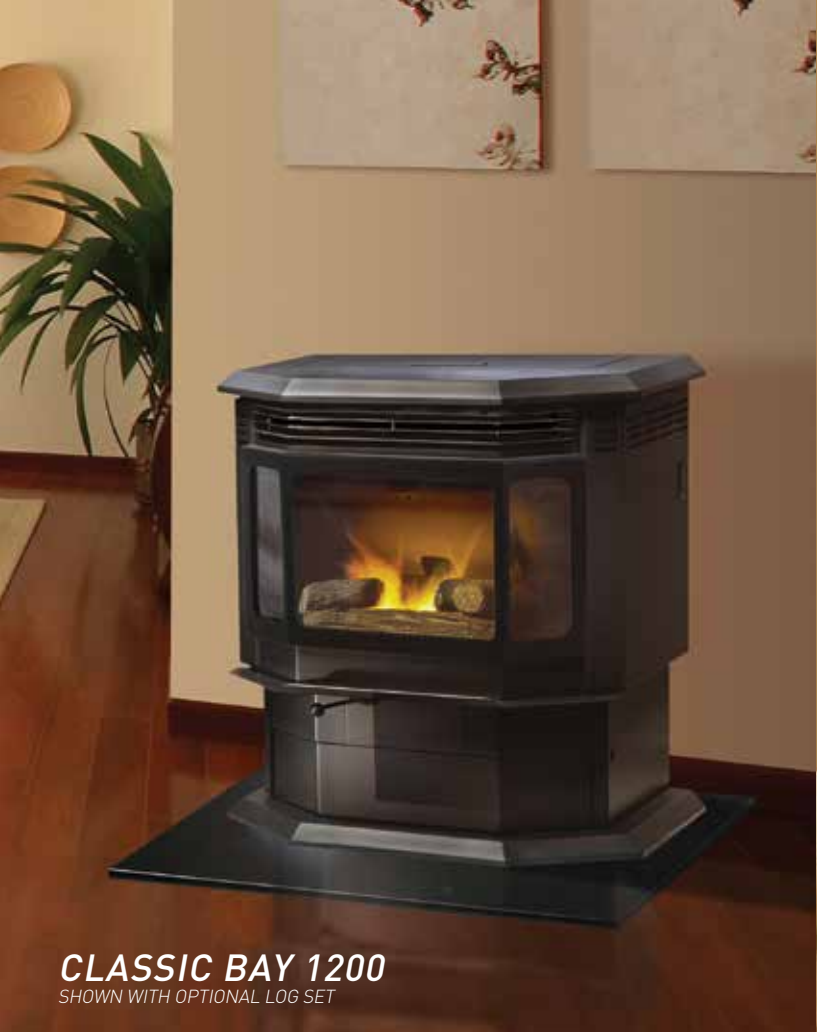
CLASSIC BAY 1200 SHOWN WITH OPTIONAL LOG SET