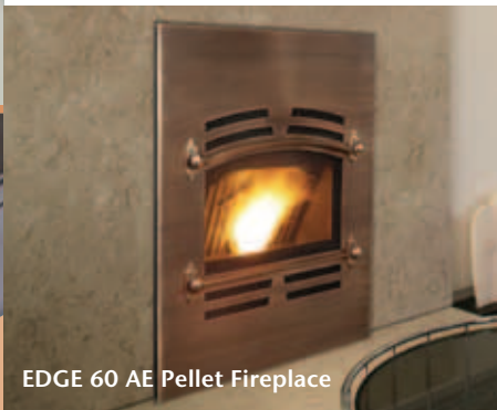
EDGE 60 AE Pellet Fireplace