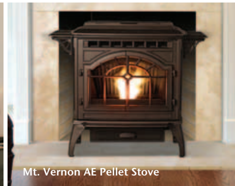
Mt. Vernon AE Pellet Stove