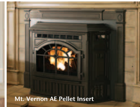
Mt. Vernon AE Pellet Insert