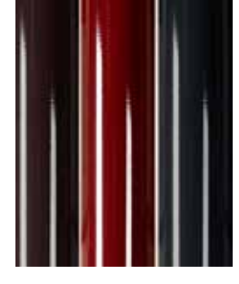
MATCHING ENAMEL PIPE