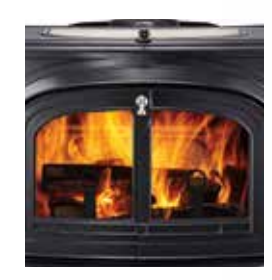
TRANSITION STYLE DOORS