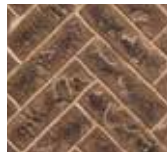
Tavern Brown Herringbone (single-sided only)