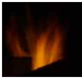
Reflective Black Glass (single-sided only)