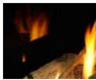
Reflective Black Glass

Contemporary Conversion Kit* – Includes Diamond and Onyx glass and stone kit.