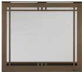
Contemporary Rectangular Front (See-through only)

Fronts – Front options and colors offer a tailored appearance to any hearth.