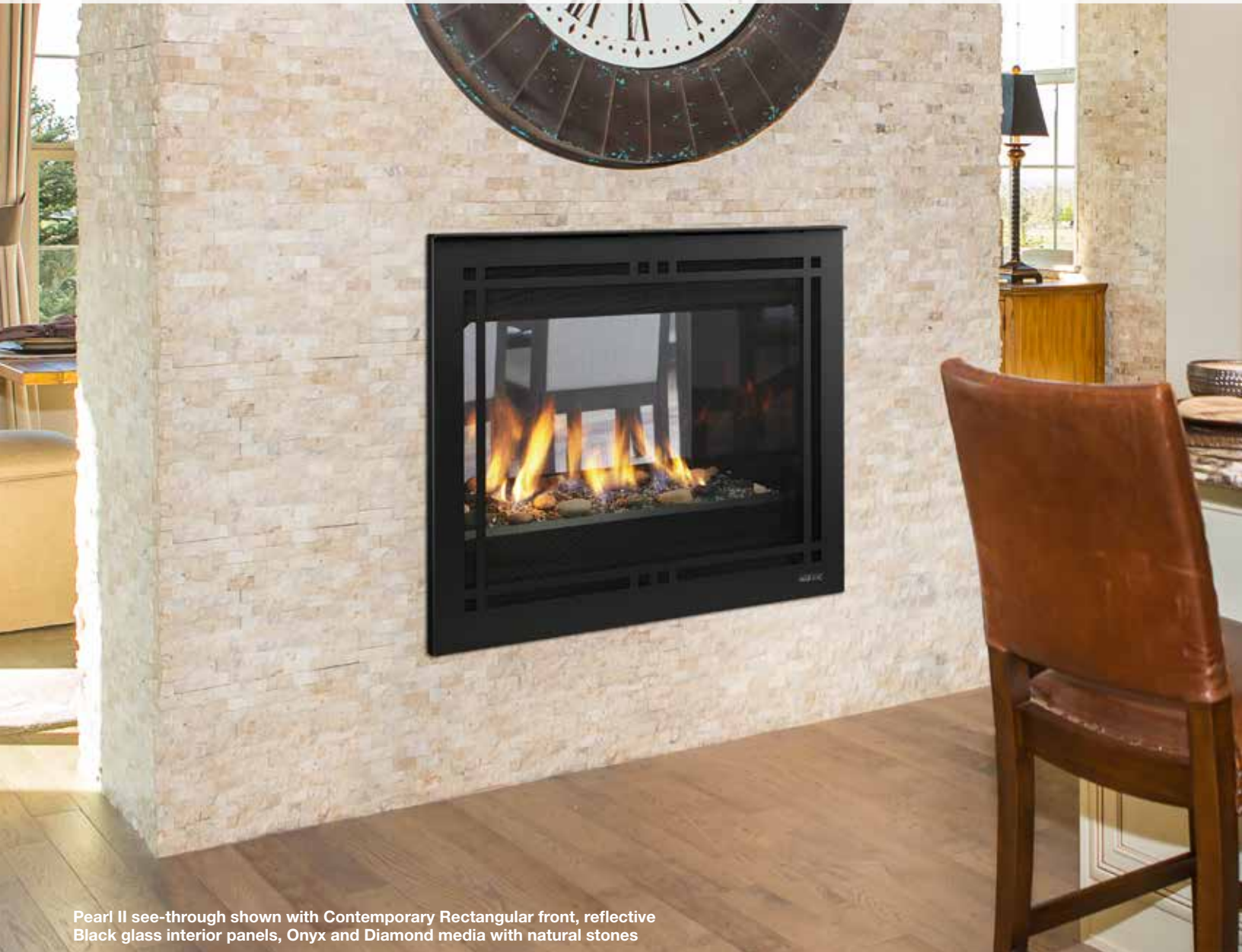
Pearl II see-through shown with Contemporary Rectangular front, reflective Black glass interior panels, Onyx and Diamond media with natural stones