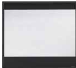
Decorative Mesh Front (Black finish only)