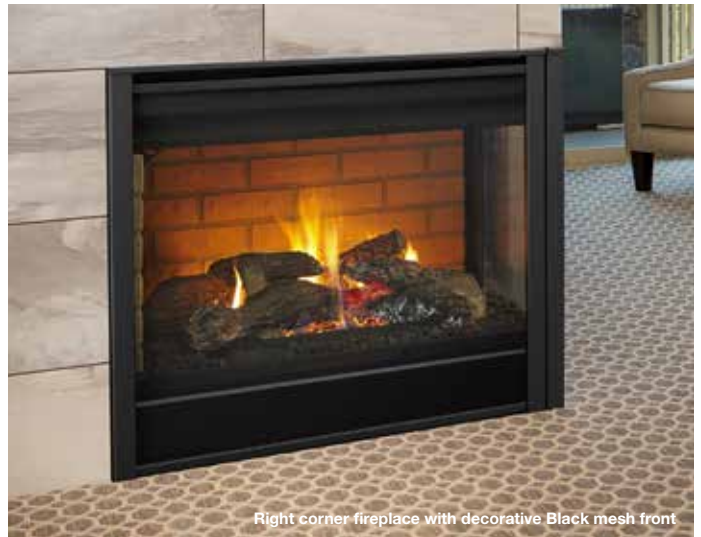
Right corner fireplace with decorative Black mesh front

Corner Fireplaces – Available in right and left corners. Same remote control and fan options available.