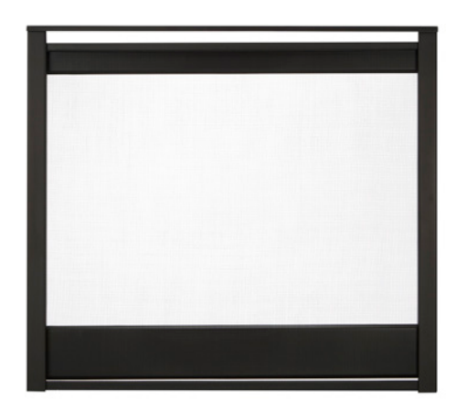
FIRESCREEN (SEE-THROUGH, PIER, LEFT & RIGHT CORNER Available in black.