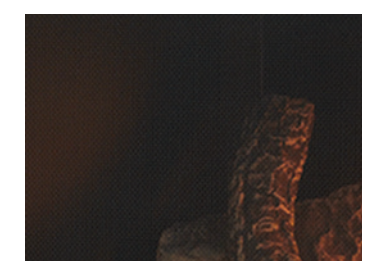
BLACK METAL PANELS (SEE-THROUGH AND PIER ONLY)