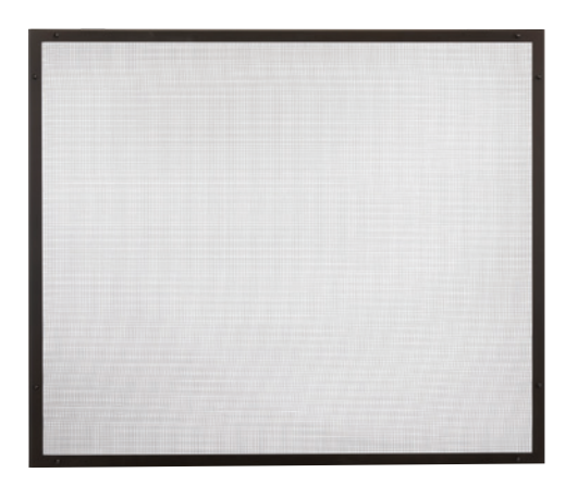
FIRESCREEN (ESCAPE) Available in black new bronze and gun metal.