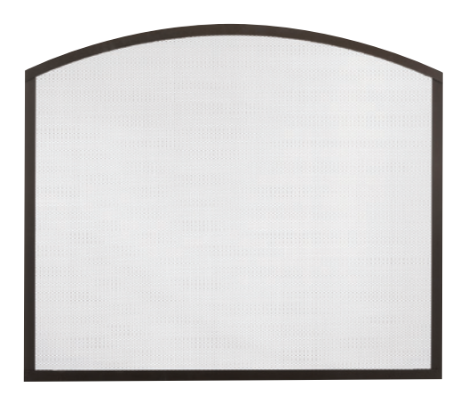
ARCHED FIRESCREEN (ESCAPE) Available in black new bronze and gun metal.