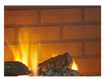
BRICK (LEFT & RIGHT CORNER ONLY)