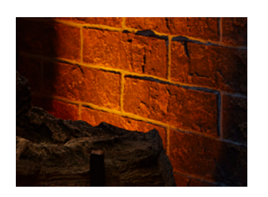
STRATFORD BRICK (ESCAPE ONLY)