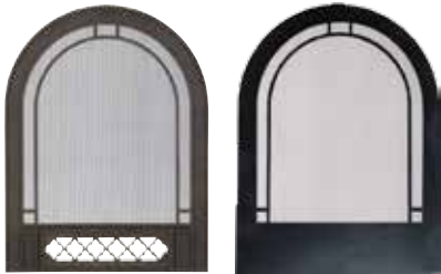
ESSENCE Available in Bronze