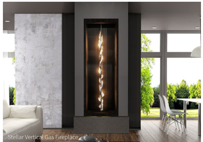
Stellar Vertical Gas Fireplace