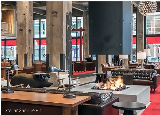
Stellar Gas Fire Pit

Stellar Fire Features In any size, any shape and for any location, combine bold creativity and advanced technology for those customized luxury hearth projects that a conventional fireplace just can't measure up to, in both traditional and contemporary styles.