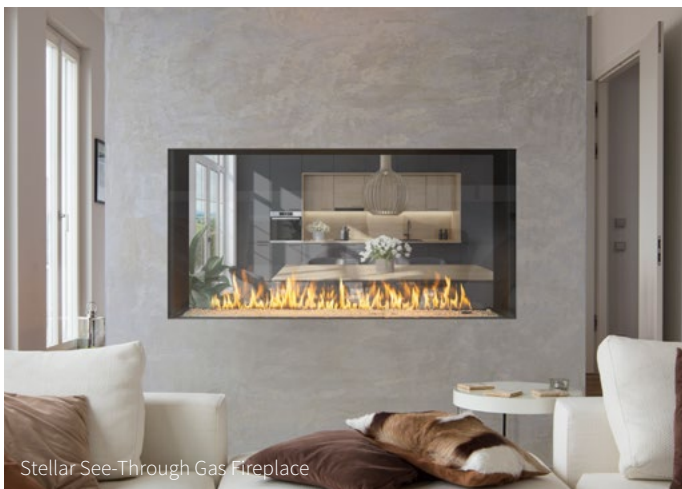
Stellar See-Through Gas Fireplace