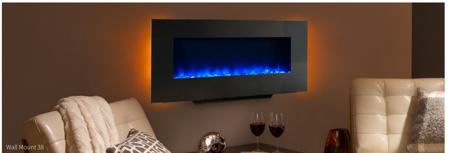
Wall Mount 38

SimpliFire Wall-Mount You can hang this fireplace on the wall like a flat-screen TV, taking up no added square footage and only requiring an electrical outlet. Pick the smaller 38” model when designing this product into your tiny-home plans.