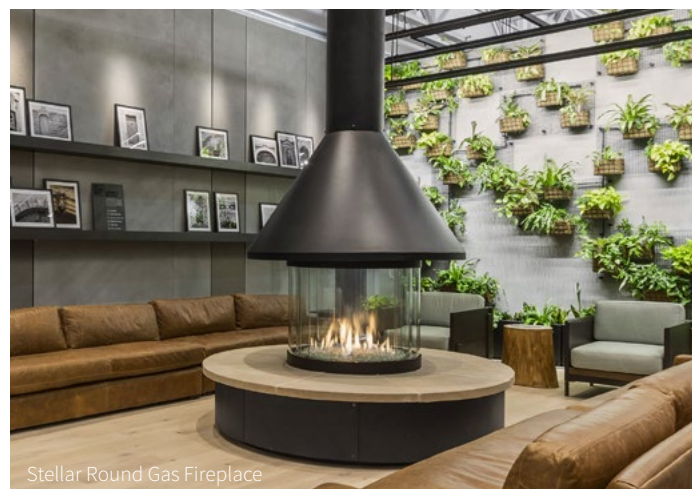
Stellar Round Gas Fireplace