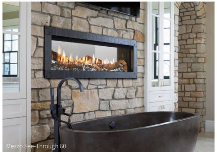
Mezzo See-Through 60