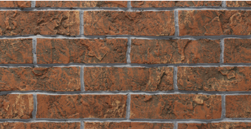
STRATFORD TEXTURED BRICK