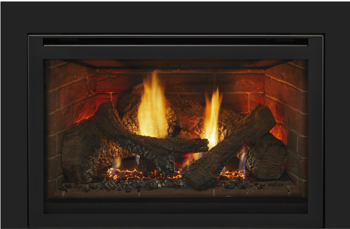
ABOVE: I30X shown with Inside Fit front in black and Stratford brick interior. COVER: I30X shown with Inside Fit front in black and standard black interior.

You don't have to sacrifice the warmth and glow of a wood burning fireplace for the simplicity and ease of gas. No more drafty, dated fireplace with messy maintenance, soot and smoke. Heat & Glo I30X gas insert fits inside an existing masonry or manufactured wood burning fireplace, providing an instant upgrade. Warm up to greater performance, safety and convenience. smoke. Heat & Glo I30X gas insert fits inside an existing masonry or manufactured wood burning fireplace, providing an instant upgrade. Warm up to greater performance, safety and convenience.