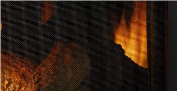
REFLECTIVE BLACK GLASS