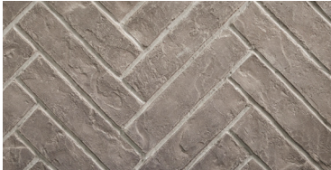
TRANQUIL GREIGE HERRINGBONE BRICK