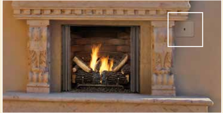
Above: Carolina 42 shown with standard mesh | Inset: Gas access panel (required for both 36-inch and 42-inch models) Shown on cover: Carolina shown with standard mesh