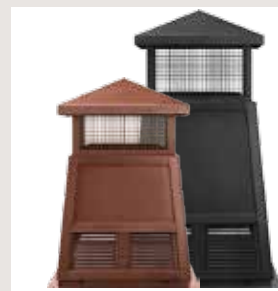
VERTICAL VENTING GAS SHROUD OR WOOD TERMINATION CAP

(For gas use with DVP-TVHW/TV or SLP-TVHW, for wood use with SL300 series pipe - requires CT-3A, SL1100 series pipe - requires CT-11A, Durachimney II pipe - requires CT-14A)