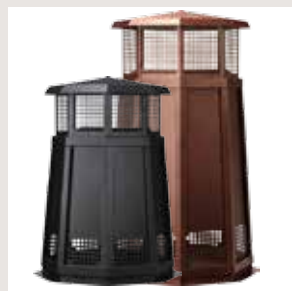
VERTICAL VENTING GAS SHROUD OR WOOD TERMINATION CAP