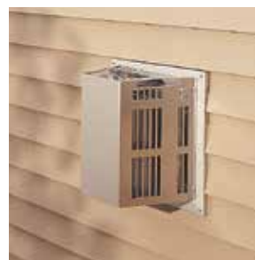
HORIZONTAL VENTING GAS SHROUD

DRC-RADIUS (For use with DVP-TRAP1, DVP-TRAP2, SLP-TRAP1 or SLP-TRAP2)