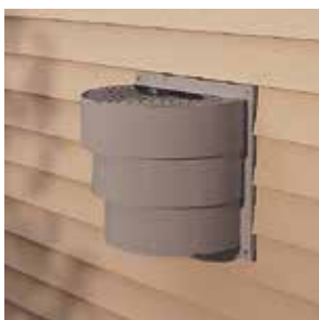
HORIZONTAL VENTING GAS SHROUD