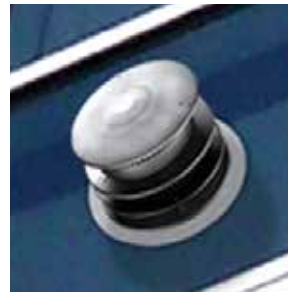
HORIZONTAL VENTING GAS TERMINATION CAP