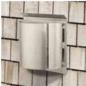
HORIZONTAL VENTING GAS TERMINATION CAP