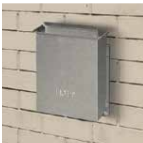
HORIZONTAL VENTING GAS TERMINATION CAP