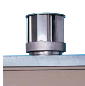
VERTICAL VENTING GAS TERMINATION CAP