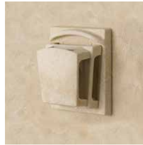
HORIZONTAL VENTING GAS TERMINATION CAP

DVP-TRAP1/DVP-TRAP2/SLP-TRAP1/ SLP-TRAP2/SLP-HHW2