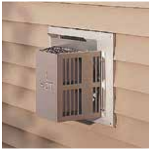
HORIZONTAL VENTING GAS TERMINATION CAP