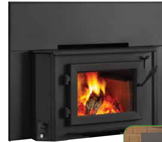
WINS18 wood-burning insert