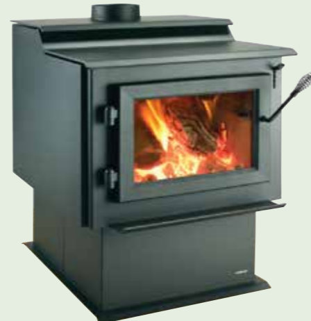
WS22 wood-burning stove