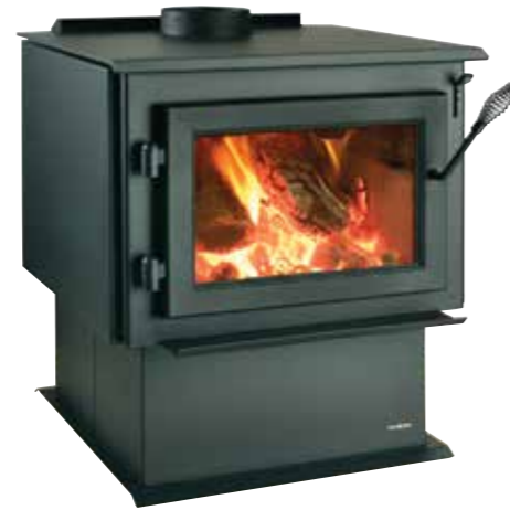
WS18 wood-burning stove

Manufactured in the USA, by the world's leading hearth company since 1927—known for value and dependability.