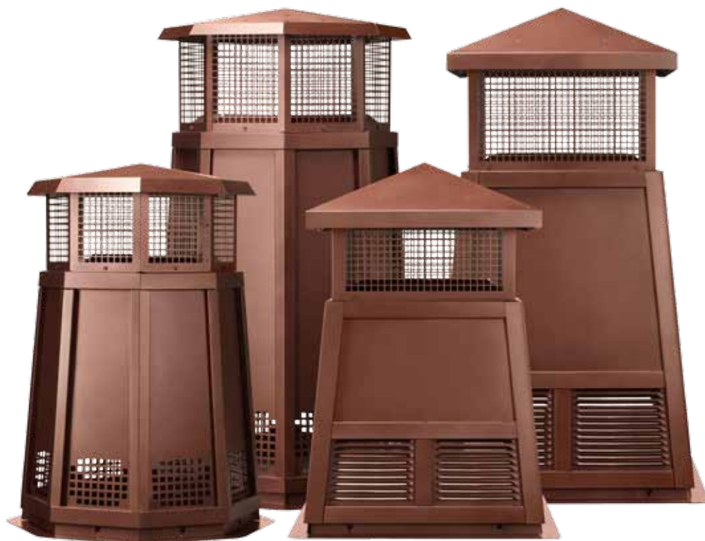
From left to right: Small Octagon, Large Octagon, Small Square, Large Square