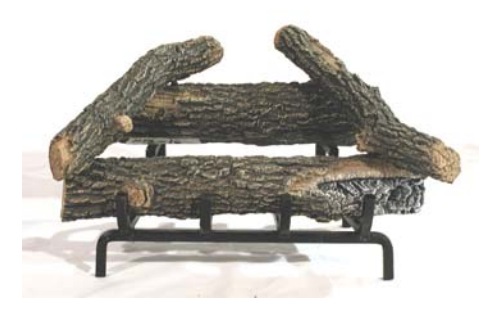
STEP FOUR: PLACE 15/VSA AS SHOWN