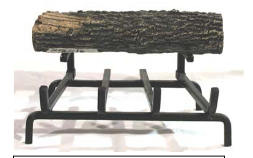
STEP ONE: PLACE 16/VSA AS SHOWN