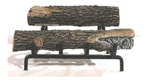
STEP TWO: PLACE 21/VSA AS SHOWN