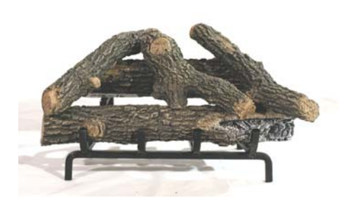
STEP FIVE: PLACE 12Y/VSA AS SHOWN