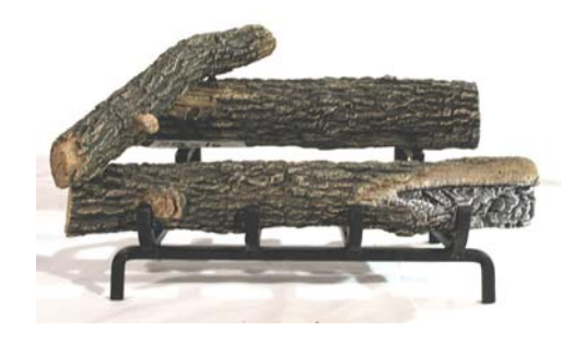
STEP THREE: PLACE 13Y/VSA AS SHOWN