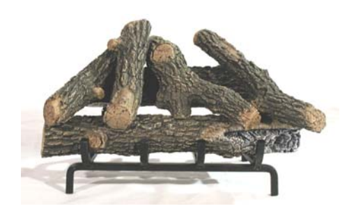
STEP SIX: PLACE 11/VSA AS SHOWN