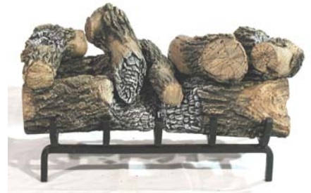
STEP SIX: PLACE 12/VSA AS SHOWN