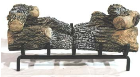
STEP SIX: PLACE 11C/VSA AS SHOWN