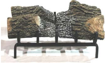
STEP FOUR: PLACE 12R/VSA AS SHOWN