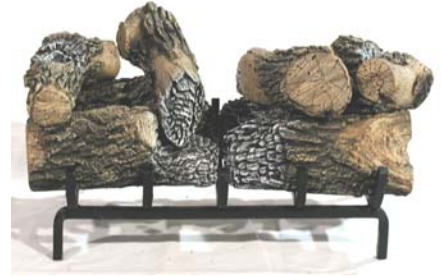
STEP FIVE: PLACE 12K/VSA AS SHOWN