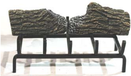
STEP TWO: PLACE 12R/VSA AS SHOWN