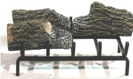
STEP THREE: PLACE 12L/VSA AS SHOWN