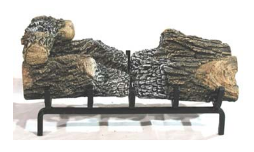
STEP FIVE: PLACE 11C/VSA AS SHOWN