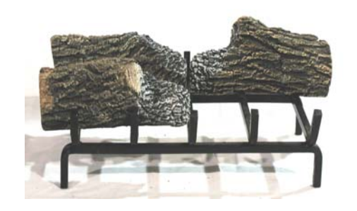
STEP THREE: PLACE 9L/VSA AS SHOWN