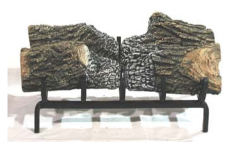
STEP FOUR: PLACE 9R/VSA AS SHOWN