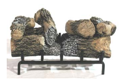
STEP FIVE: PLACE 12K/VSA AS SHOWN