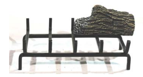
STEP ONE: PLACE 9L/VSA AS SHOWN