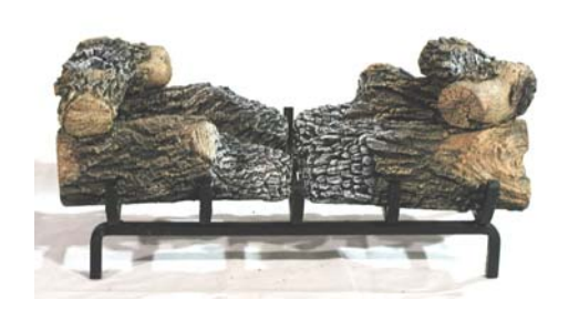
STEP SIX: PLACE 11C/VSA AS SHOWN