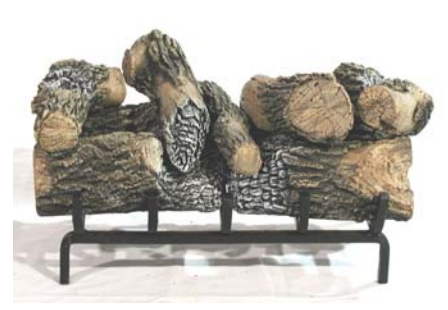
STEP SIX: PLACE 12/VSA AS SHOWN