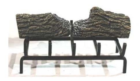
STEP TWO: PLACE 9R/VSA AS SHOWN