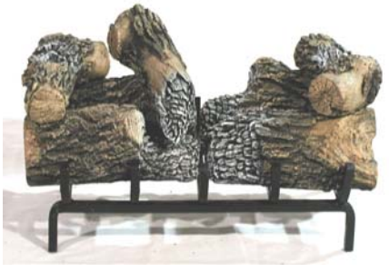
STEP SEVEN: PLACE 12K/VSA AS SHOWN