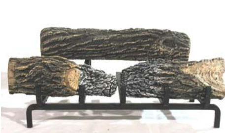
STEP THREE: PLACE 12R/VSA AS SHOWN