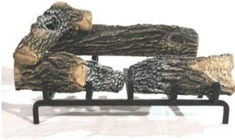
STEP FOUR: PLACE 11C/VSA AS SHOWN