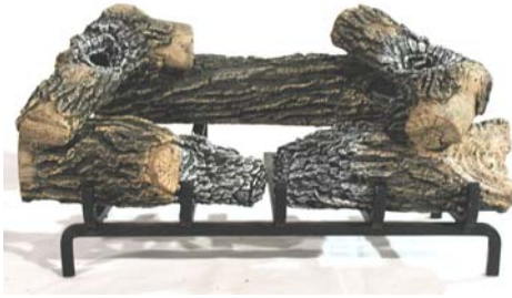
STEP FIVE: PLACE 11C/VSA AS SHOWN