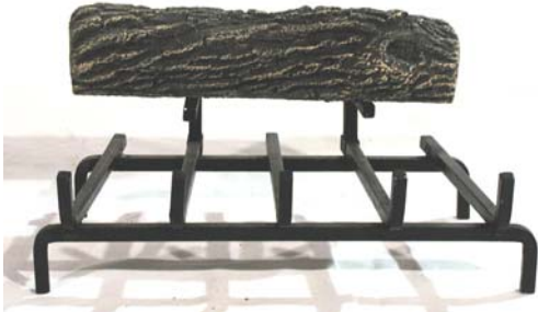
STEP ONE: PLACE 18/VSA AS SHOWN