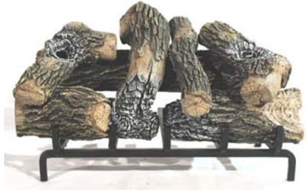
STEP SEVEN: PLACE 12/VSA AS SHOWN