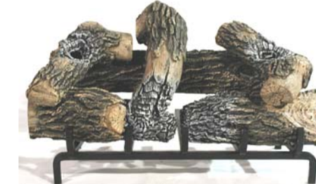
STEP SIX: PLACE 12K/VSA AS SHOWN