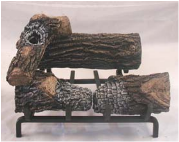
STEP FOUR: PLACE 11C/VSA AS SHOWN