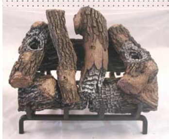
STEP SEVEN: PLACE 12/VSA AS SHOWN