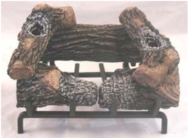
STEP FIVE: PLACE 11C/VSA AS SHOWN