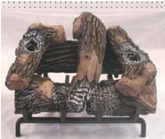
STEP SIX: PLACE 12K/VSA AS SHOWN