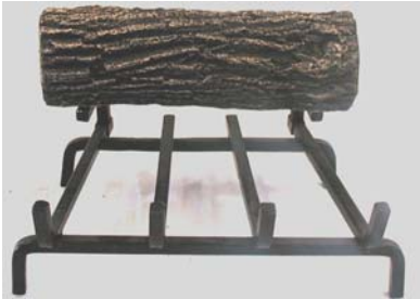
STEP ONE: PLACE 15/VSA AS SHOWN