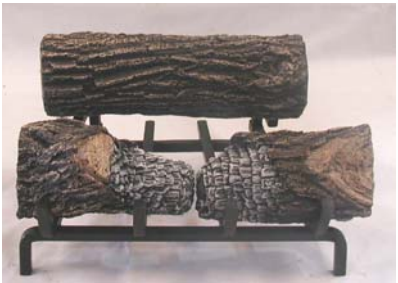
STEP THREE: PLACE 9R/VSA AS SHOWN