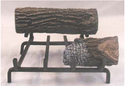
STEP TWO: PLACE 9L/VSA AS SHOWN