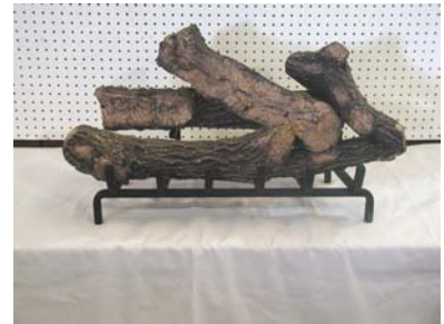
STEP FOUR: PLACE 14C/VSA AS SHOWN