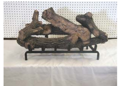
STEP FIVE: PLACE 14Y/VSA AS SHOWN