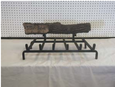
STEP ONE: PLACE 25P/VSA AS SHOWN