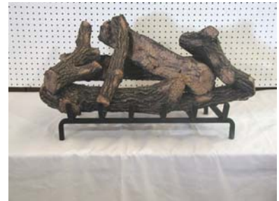
STEP SIX: PLACE 13C/VSA AS SHOWN