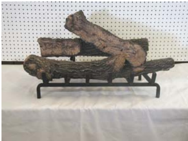
STEP THREE: PLACE 19C/VSA AS SHOWN