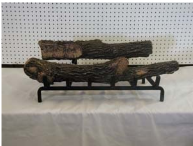
STEP TWO: PLACE 30C/VSA AS SHOWN