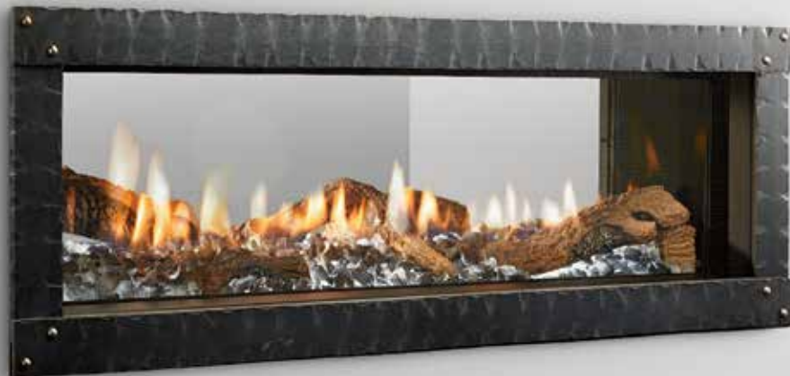
HEAT & GLO MEZZO SEE-THROUGH