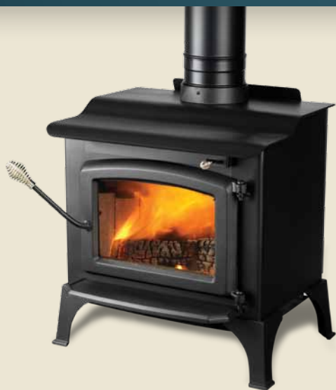
Shown in Classic style. Also available in Horizon style.

The Windsor line is produced in our energy-efficient factory using recycled materials. Your new stove or insert is both crafted with eco-friendly processes and designed to be an effective heating source for your home.