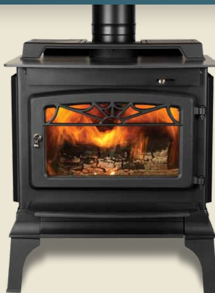
Shown in Horizon style. Also available in Classic style.