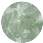
CRYSTAL GLASS (STANDARD)