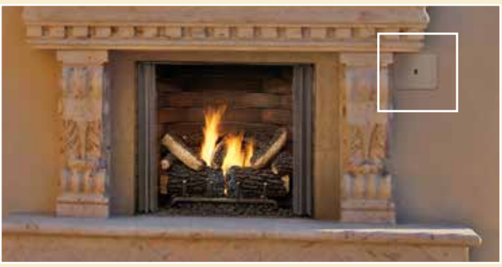
Above: Carolina 42 shown with standard mesh | Inset: Gas access panel (required for both 36-inch and 42-inch models) Shown on cover: Carolina shown with standard mesh