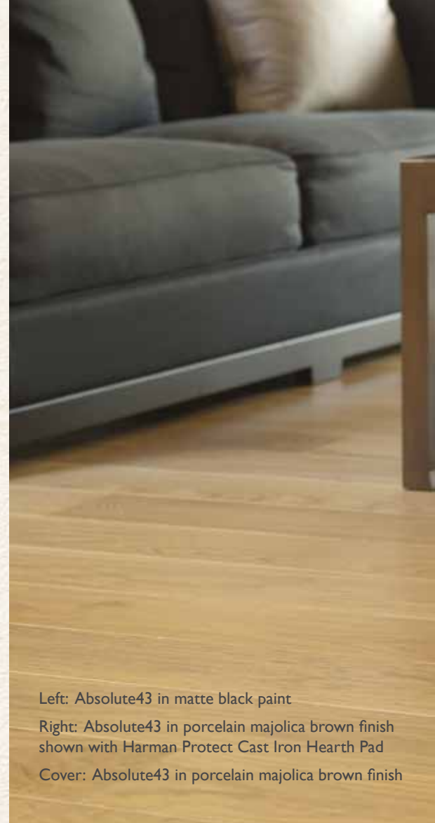
Left: Absolute43 in matte black paint Right: Absolute43 in porcelain majolica brown finish shown with Harman Protect Cast Iron Hearth Pad Cover: Absolute43 in porcelain majolica brown finish