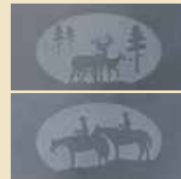
Slate tile accents

Engineering excellence and heating performance make every Harman stove or insert a practical heating solution. “Built to a standard, not a price.”