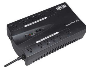
Tripp Lite INTERNET750U