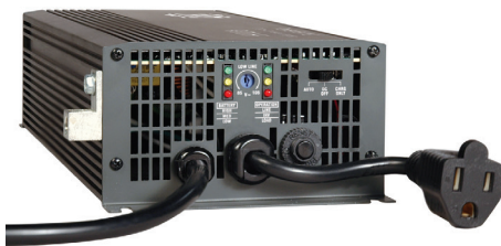
Tripp Lite APS700HF

700W PowerVerter APS 12VDC 120V Inverter/Charger with Auto-Transfer Switching