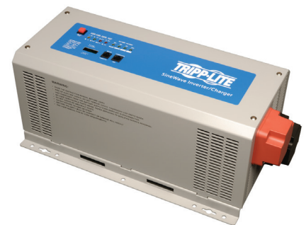
Tripp Lite APS1012SW

1000W PowerVerter APS 12VDC 120V Inverter/Charger with Pure Sine Wave Output,