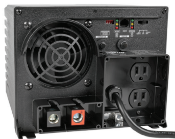
Tripp Lite APS750

750W PowerVerter APS 12VDC 120V Inverter/Charger with Auto-Transfer Switching